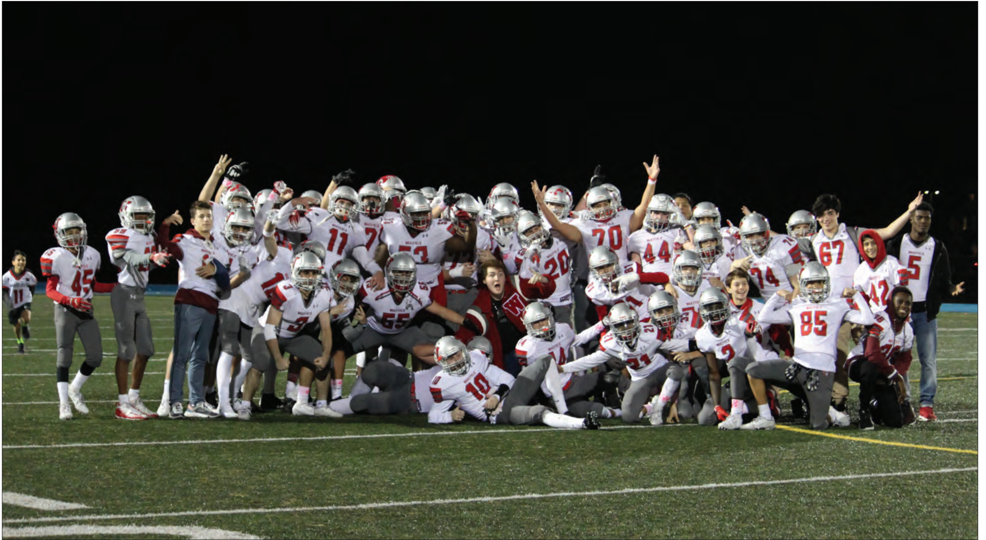
THE WARRIORS celebrate a win over Wilmington in their regular season finale. The 35-14 victory officially punched Wakefield's ticket to the Div. 4 North Tournament. Wakefield finished with a winning record for the first time since 2013.

same deal. There will always be a lot of emotion, the crowds are always great, and for the seniors it starts to sink in that this is it. There's still that level of excitement and emotion about it."